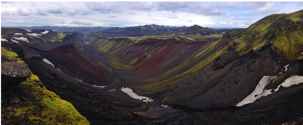
The view of the magnificent Eldgjá canyon (Fire canyon) towards Katla Volcano.

Let me tell you a little bit about the highlands of Iceland. If you have not been there, you have a lot to experience! The rugged beauty and the powerful peace and quiet up there is a brilliant battery charger. The landscape consists of one or more of the following: white glaciers, black sands, green mountain tops, rock formations of different varieties, blue or brown rivers, colorful hot springs, small waterfalls, big waterfalls and black volcanoes to name a few. Sometimes you go whole days without seeing a single person and other times it is like being in downtown Reykjavik on a lovely Saturday.